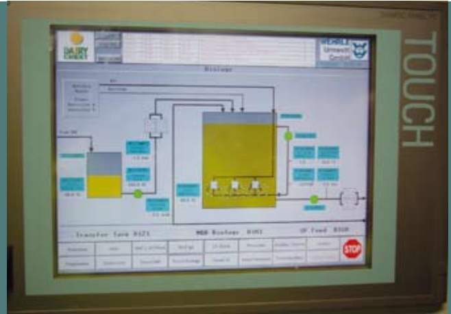
Figure 4 Screen Shot of Wehrle MBR In Touch control system

For additional process security, as is required for the potential upgrade of the plant capacity to 1000 m 3 /d in the future, it is intended that the BAFF tank is also upgraded, removing internal packing media and aeration system, to convert the tank to an additional bioreactor. At that stage, both bioreactors would feed the UF system, each loop then having all 6 membrane modules operational.