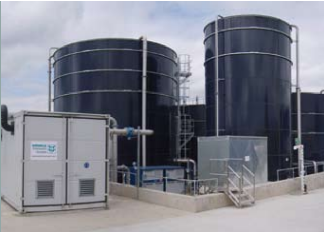
Figure 3 Wehrle wastewater treatment system at Folston