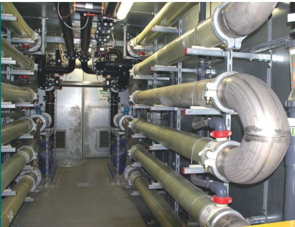
Figure 1 Pre-tested and containerised UF system, MCC and controls.